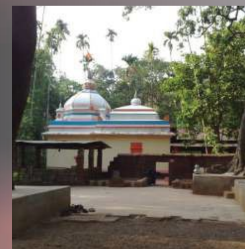
KESHAVRAJ & VYAGHRESHWAR