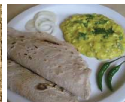
SPECIAL PITHLA BHAKRI