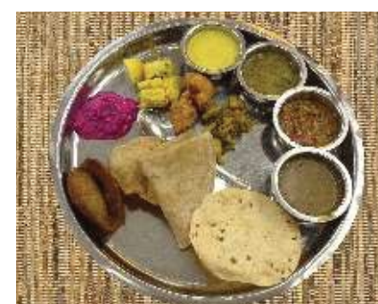
MAHARASHTRIAN VEG THALI