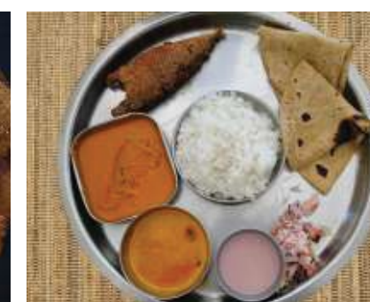
SPECIAL FISH THALI